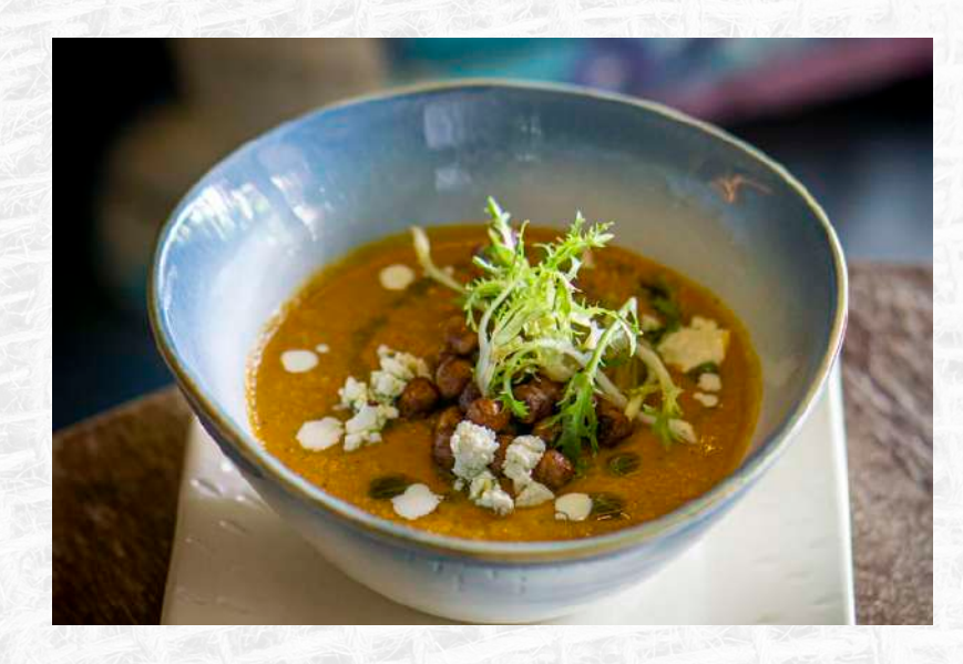
CREAMY TOMATO & CHICKPEAS SOUP Creamy tomato soup, roasted chickpeas, feta cheese, coriander oil.

PLAGE MINESTRONE AL PESTO Seasonal diced vegetable, tomato essence, herb pesto, basil and shaved parmesan cheese.