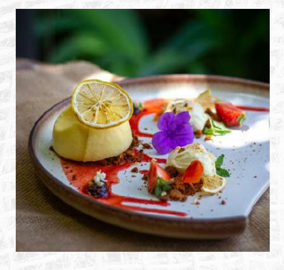
CREAMY LEMONADE 80K WITH ALMOND CRUMBLE